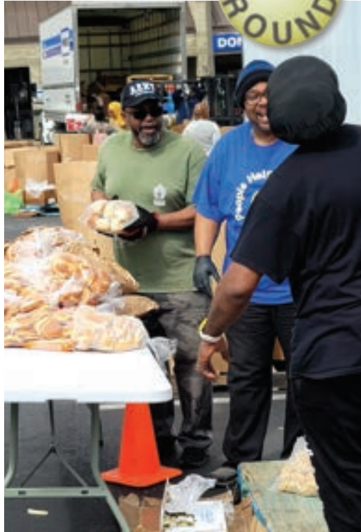
Volunteers with People Help Exchange sort food for distribution to those in need.

"We fulfill our mission by responding to the needs of the community through food distributions and supportive services for households that are behind on their utilities, rent or mortgage. Because we believe that access to nutritious food and housing is a basic human right, everyone at the Exchange works to make hunger and homelessness rare, brief, and nonrecurring in the communities that we serve. We also provide community linkages to organizations providing services that fall outside of our scope."